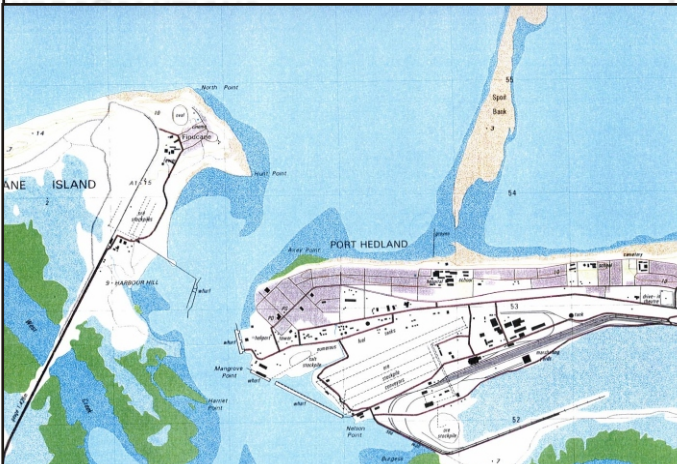
Part map